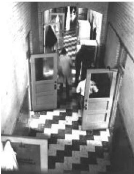
A hallway in the old Physics/Chemistry Bldg. (ca. 1950) that has since become the John Widtsoe Mathematics Bldg.