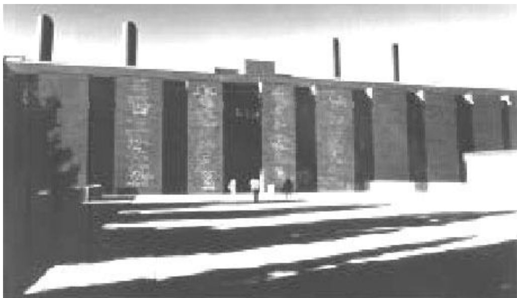
View of the South Wing of the HEB in 1996, the week of graduation. As a going away present several anonymous undergraduate students clandestinely rappelled from the roof of both wings of the HEB in the middle of the night and decorated the walls and walkway with numerous chemical equations and figures using chalk. The trick was repeated again in 1997