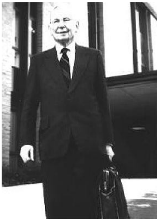
Henry Eyring at the dedication of the Chemistry Building, named in his honor in 1980.