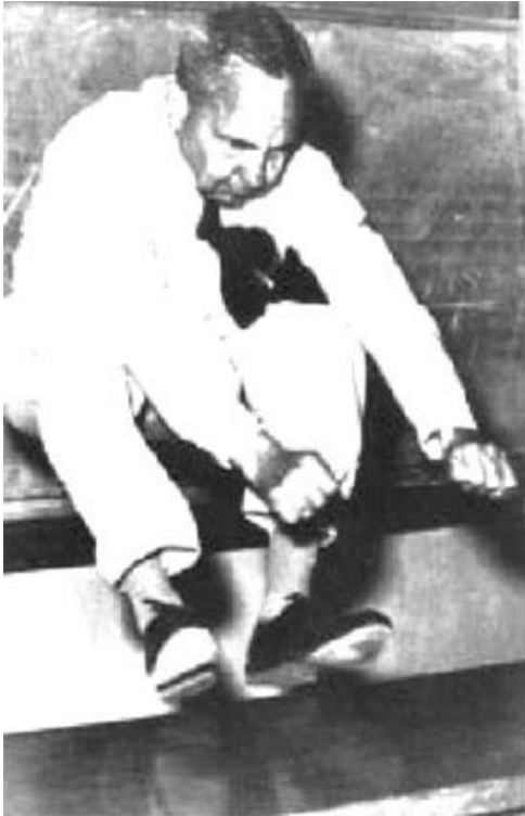
Henry Eyring, jumping on top of a desk from a standing position circa 1960.